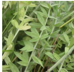
Showy Locoweed Oxytropis splendens Basal · Up to 35cm L7 – 25cm; Pinnately comp