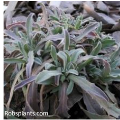
Spatulate Bladderpod Lesquerella alpina Basal · 3 – 12cm L1 – 4cm x W1 – 2.5mm