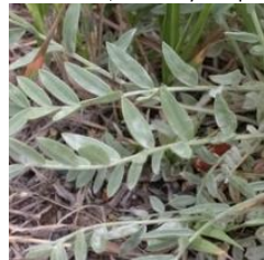
Early Yellow Locoweed Oxytropis sericea Basal · 10 – 40cm L4 – 30cm; Pinnately comp