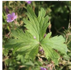
Sticky Purple Geranium Geranium viscosissimum Opposite · 20 – 90cm W5 – 11cm; Palmate