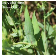
Smooth Aster Symphyotrichum laevis Alternate · 30 – 100cm L2 – 10cm x W10 – 45mm