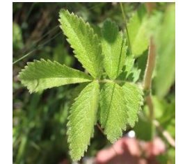
White Cinquefoil Potentilla arguta Basal · 40 – 100cm L1.5 – 4cm; pinnately comp