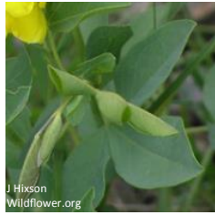
Golden Bean Thermopsis rhombifolia Alternate · 10 – 40 cm L2 – 4cm; digitate comp