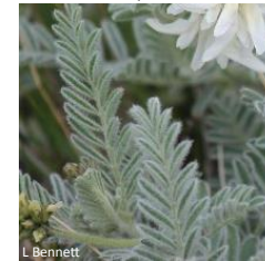
Drummond's Milkvetch Astragalus drummondii Basal · 40 – 70cm L6 – 14cm; Pinnately comp