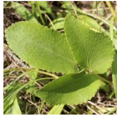
Meadow Parsnip Zizia aptera Basal & Alternate · 20 – 60cm L1 – 7.5cm x W1 – 2cm