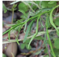
Hare Bells Campanula rotundifolia Alternate · 20 – 45cm L1 – 7.5cm x W<1cm