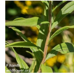
Canada Goldenrod Solidago canadensis Alternate · 50 – 200 cm L5 – 10cm x W5 – 30mm