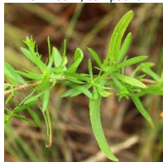
Tufted White Prairie Aster Symphyotrichum ericoides Alternate · 30 – 80cm L1 – 5cm x W10 – 25mm