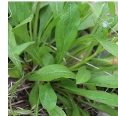
Smooth Fleabane Erigeron glabellus Basal · 10 – 50cm L5 – 10cm x W5 – 15mm