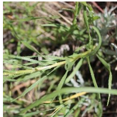
Dotted Blazingstar Liatris punctata Alternate · 20 – 60cm L5 – 15cm x W2 – 4mm