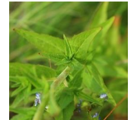
Horneman's Willowherb Epilobium hornemannii Opposite · 10 – 35cm L19 – 40mm x W6 – 14mm