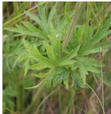
Long Fruited Anemone Anemone cylindrica Basal & Palmate · 15 – 80cm L2.5 – 6cm x W3 – 10cm