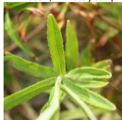
Pearly Everlasting Anaphalis margaritacea Alternate, Woolly · 30 – 100cm L7 – 13cm x W <2cm