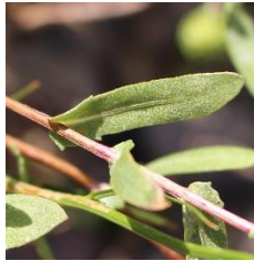
Curly Cup Gumweed Grindelia squarrosa Alternate · 30 – 60cm L1 – 3cm x W1 – 7mm