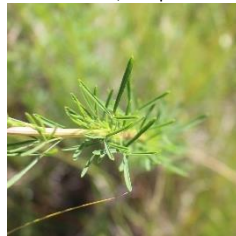
Purple Prairie-Clover Dalea purpurea Alternate · 30 – 80cm L1 – 5cm; margins rolled