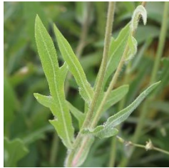
Gaillardia Gaillardia aristata Alternate · 20 – 60cm L5 – 12cm x W5 – 40mm