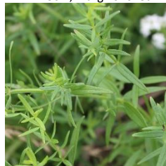
Northern Bedstraw Galium boreale Whorls of 4 · 30 – 80cm L2 – 5cm x W2 – 8mm