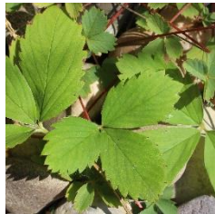
Wild Strawberry Fragaria virginiana Basal · 5 – 25cm L3 – 20cm; compound