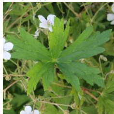
Wild White Geranium Geranium richardsonii Opposite · 40 – 80cm W3 – 15cm; Palmate