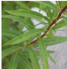
Fireweed Chamerion angustifolium Alternate · 1.3 – 3m L1.5 – 20cm x W0.5 – 35mm