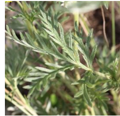
Prairie Cinquefoil Potentilla pensylvanica Alt & Pinnately comp · 15 – 30cm L2 – 10cm