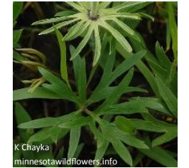
Prairie Crocus Anemone patens Basal · 8 – 40cm L2.5 – 5cm x W3 – 5cm