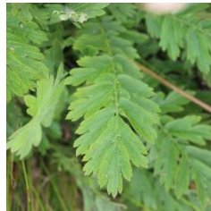
Three-Flowered Avens Geum triflorum Basal · 20 – 40cm L5 – 15cm; compound