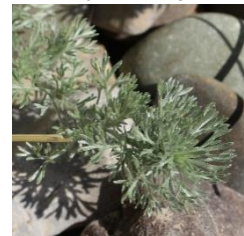
Prairie Sagewort Artemisia frigida Basal&Alternate · 30 – 80cm L1 – 3cm; sage scent