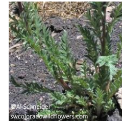
Silky Scorpionweed Phacelia sericea Alternate · 10 – 40cm L3 – 12cm; linear lobes