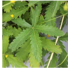
Graceful Cinquefoil Potentilla gracilis Palmate & Comp · 40 – 80 cm W6 – 30cm; reverse silky hair