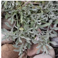
Rosy (Pink) Pussytoes Antennaria rosea Basal · 15 – 50cm L1 – 2.5cm x W2 – 7mm