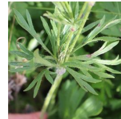
Cut-leaved Anemone Anemone multifida Basal & Palmate · 15 – 60cm L1.5 – 5.5cm x W1 – 10cm