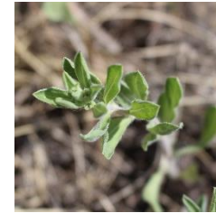
Hairy Golden Aster Heterotheca villosa Alternate · 10 – 50cm L2 – 5cm x W2 – 13mm