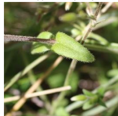
Long-leaved Chickweed Stellaria longifolia Opposite · 10 – 50cm L < 5cm